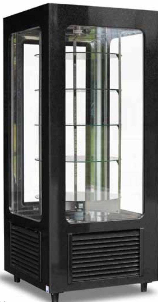
I-Jola 4 TREND*